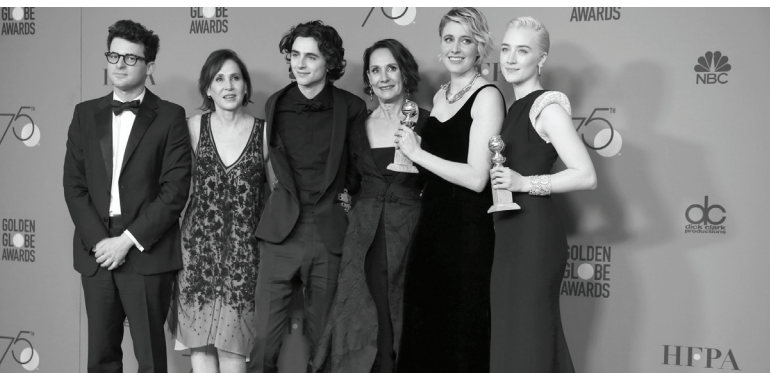
Greta Gerwig and the cast of "Lady Bird" pose backstage with their award for Best Motion Picture - Musical or Comedy at 75th Golden Globe Awards, Beverly Hills, California, U.S.

NEW YORK, JAN 8 /-/- Veteran actor Tom Hanks said playing real-life characters on-screen is a "huge responsibility" for him. Over the years, the 61-year-old actor has featured in a number of biographical films by playing Walt Disney in "Saving Mr Banks", pilot Chesley Sullenberger in "Sully" and the titular mariner in "Captain Phillips", to name a few. "I play real people a lot. And it is a huge responsibility. Anyone you are playing somebody who was alive, for good or for bad, that performance becomes a version of an official record of what happened; what motivated them, what obstacles they faced, and how they got through their particular struggle," Hanks told W magazine. "There's a degree of leeway that you can allow yourself as long as you're not turning good guys into bad guys, or knowledge into ignorance," he added. Hanks also said that it is easier playing someone "who's no longer alive." "Because then you don't have to meet them," the actor added. (PTI)