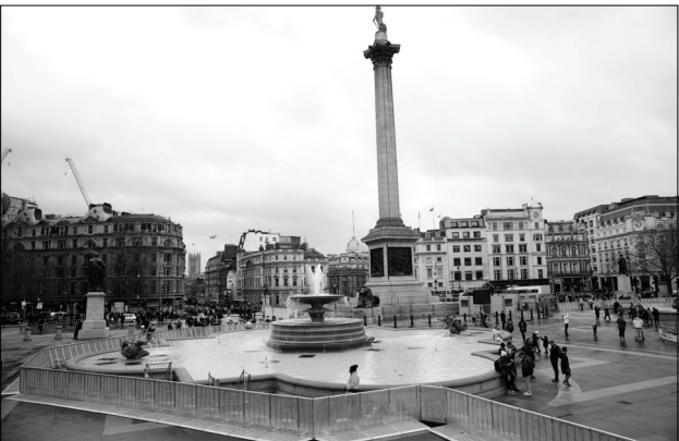
Baracades are erected in Trafalgar Square ahead of New Year's Eve celebrations in London, Britain

interests. It would be naive to expect a person who has spent crores on getting education to have social interest and service attitude towards healthcare. The already over privatized healthcare in our country will further get expensive and go out of reach of the majority of citizens who are already devoid of quality health care due to high cost of out of pocket expenditure. It is high time that the medical profession and the civil society speak up for positive actions towards raising the standard of medical education and bringing it within the reach of common man. There is need for strong debate in the parliament as to how healthcare system should be so as to provide universal healthcare to all. (IPA)