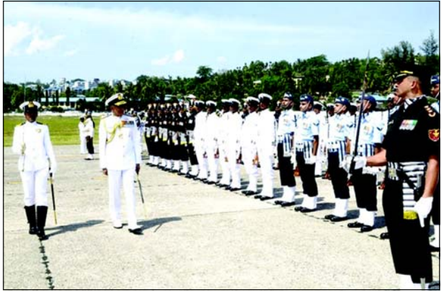
Chairman COSC and CNS would be visiting Air Force Station Carnic where he