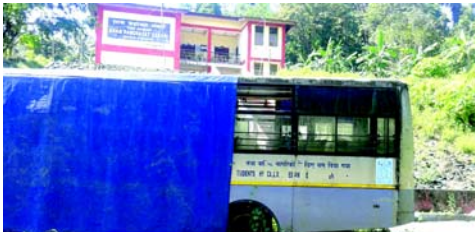
Picture shows another bus donated under the MPLAD scheme to Sabari Panchayat in Middle Andaman left to rot near the roadside of the Panchayat Office. According to reports, lack of repairs and maintenance has left the bus facility redundant for the past two years.