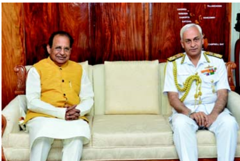
Picture shows Admiral Sunil Lanba, PVSM, AVSM, ADC, Chief of Naval Staff, currently on a visit to the islands, calling on the Lt Governor, Prof. Jagdish Mukhi, at Raj Nivas on Tuesday. Issues relating to the security of A & N Islands were discussed.