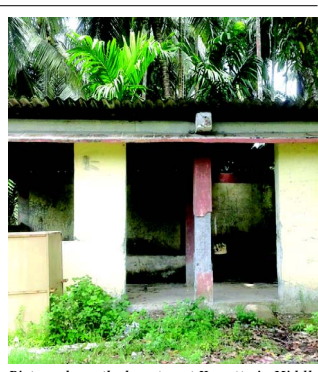
Picture shows the bus stop at Yerratta in Middle Andaman in an appalling state. Commuters in the region have reported stopped using the facility for fear of mishap and villagers have started demanding immediate renovation of the bus stand.

More Local News on Page-3,5 Students Corner on Page-6