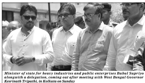
Minister of state for heavy industries and public enterprises Babul Supriyo along with a delegation, coming out after meeting with West Bengal Governor Keshri Nath Tripathi, in Kolkata on Sunday