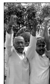
Members of Bharatiya Kisan Ganghri raising slogans during a demonstration to press their various demands at Jantar Mantra, in New Delhi.