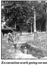
Excavation work going on near BBD Bag Mini Bus Stand adjacent to Lalidighi to identify the location of underground public utilities such as cables of CESC & Telecommunication and pipelines of water and sewerage so that these public utilities can be shifted properly. The excavation is part of construction work for Mahakaran Station of East West Metro.

Every rescue and relief team comprises 35 maniac personnel including five women who are well equipped with modern equipments to tackle any calamity in their respective areas of responsibility and to provide relief to the affected populace in the capacity of their first responder. "The SSB has proved itself to be a force with human face by working for flood relief, cloudburst, landslides, during earthquakes, during droughts, cyclones, epidemics and accidents etc. The local populace always found SSB steadfastly with them during difficult times," she added. During the review meeting of SSB Union home minister Rajnath Singh was appreciative of excellent services rendered by SSB in disaster relief and in the plan of raising RRTs in each sector. The DG said that they had only three RRTs and therefore to further raise one RRT in each sector a consultative meeting was convened with National Disaster Management Authority (NDMA). Consequently, SSB finally decided to set up