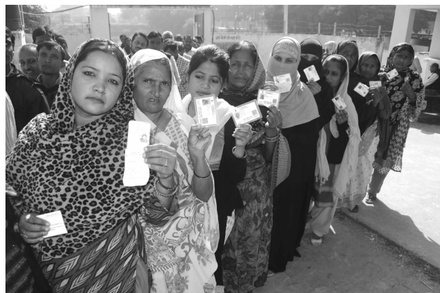
Voters standing in a long queue to cast their votes during third phase of the Uttar Pradesh municipal election at a polling station in Mirzapur on Wednesday.

now with metro he reached his destination in barely 20 minutes. "It's an awesome experience," he said. This is the biggest public private partnership (PPP) in the world. It is the first transit oriented development (TOD) project that will exploit the real estate and earn revenue by leasing out commercial and office spaces inside and outside the metro stations across the city, an official statement said.