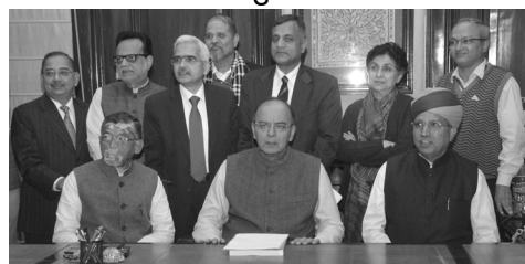
Union Minister for Finance and Corporate Affairs, Arun Jaitley flanked by Minister of State for Finance and Corporate Affairs Arjun Ram Meghwal, the Minister of State for Finance, Santosh Kumar Gangwar giving final touches to the Union Budget 2017-18, in New Delhi.

"Currency shortages also affect supplies of certain agricultural products, especially milk (where procurement has been low), sugar (where cane availability and drought in the southern states will restrict production), and potatoes and onions (where sowings have been low)," the Survey said, asking the government to be vigilant on prevent other agricultural products becoming what pulses was in 2015-16. It also listed a surge in global oil prices and possible eruption of trade tensions amongst the major countries as other risks.