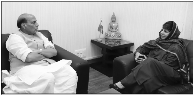
Jammu and Kashmir Chief Minister Mehbooba Mufti called on Union Home Minister Rajnath Singh, in New Delhi