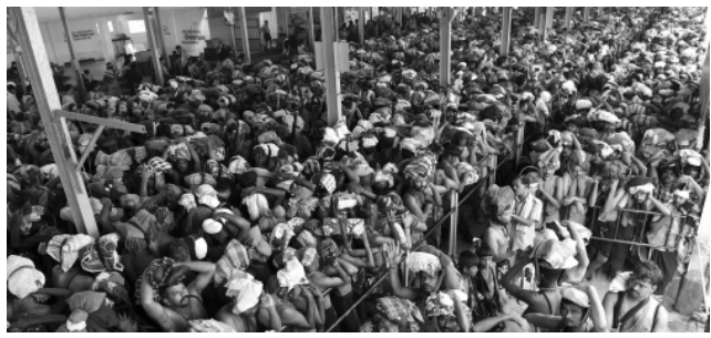
Famed Sabair mala hill shrine witnessed a heavy rush of pilgrims from different parts of the country on Saturday.