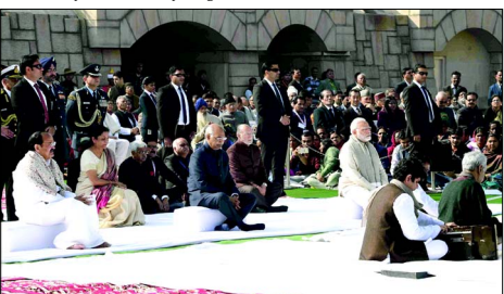
President Ram Nath Kovind attending Sarva-Dharma-Prarthana being organised on the occasion of 70th Death Anniversary of Mahatma Gandhi, at Rajghat, in New Delhi on Tuesday.

Modi, Naidu and other dignitaries paid floral tributes at the Gandhi Smriti. The Prime Minister also interacted with students present at the event. Earlier in the day, Modi paid homage to Gandhi and recalled the sacrifices made by those who laid down their lives for the country. "Remembering Babu on his Punya Tithi," he said in a tweet. "We bow to all those martyrs who have sacrificed themselves in service of our nation. We will always remember their courage as well as dedication towards the nation." Modi said.