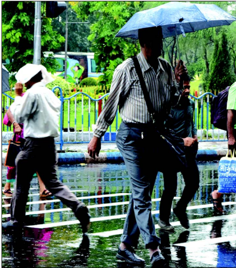
Pedestrians on the city street during the rains on Monday—Arijit Ganguly

Poll panel holds meeting with state govt, discusses security