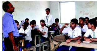
to look into safety issues. safety issues which ranged from healthy food, nutrition, protection from outsiders, stop any use of tobacco and drugs in the campus and safeguard to cyber threats," he said.

KOLKATA, NOV 18 /-/- The West Bengal government will spend Rs 70 crore to improve safety infrastructure in schools, a top official of the School Education department said today. "Developing sound infrastructure in schools with good hygiene and clean environment dominates the state's agenda," Education secretary, School Education department, Dushyant