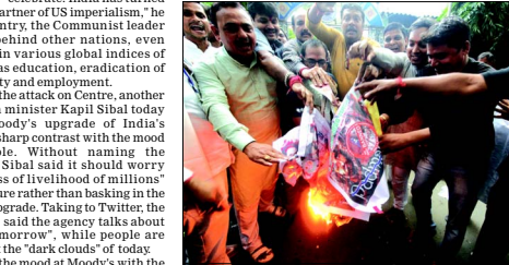
Members of the Bharat Kshatriya Samaj burning the poster of the film Padmavati near Press Club, Kolkata