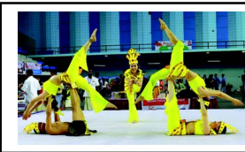
Vietnamese YOGA players performs on the concluding day of the 8th Asian Yoga Sports Championship at Jimmy George Indoor Stadium in Thiruvananthapuram on Sunday.