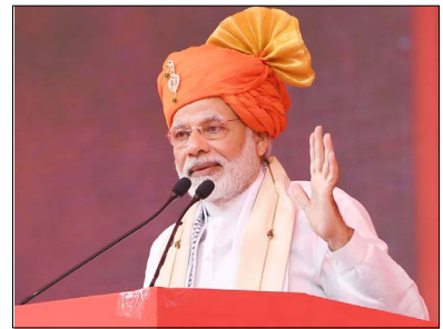
Prime Minister, Narendra Modi addressing the public meeting after inaugurating several projects, at Anand, Gujarat on Sunday

Days before Air For Day is celebrated on October 8 to mark its birth in 1932, Modi said "air warriors" have proved themselves to be the epitome of "every citizen's eye through display of sheer might in the skies. He also recalled the contribution of the IAF in transporting men and material to Srinagar in 1947 when Pakistani attackers had tried to capture Jammu and Kashmir. He said IAF played a key role in 1965,