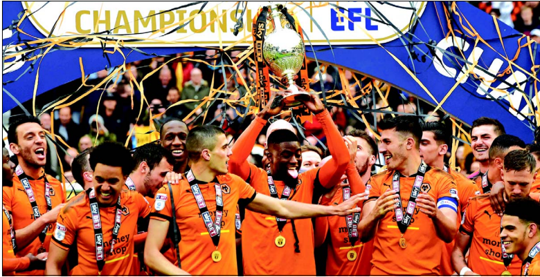
Championship - Wolverhampton Wanderers v Sheffield Wednesday - Molineux Stadium, Wolverhampton, Britain Wolverhampton Wanderers players celebrate winning the Championship - Reuters-11R