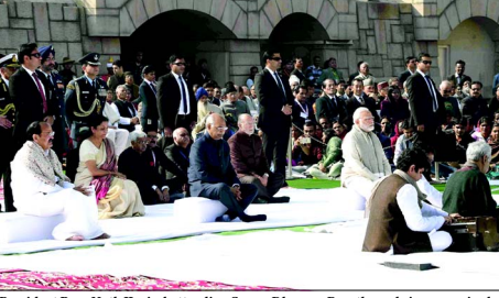
President Ram Nath Kovind attending Sarva-Dharma-Prarthana being organised on the occasion of 70th Death Anniversary of Mahatma Gandhi, at Rajghat, in New Delhi on Tuesday.

Modi, Naidu and other dignitaries paid floral tributes at the Gandhi Smriti. The Prime Minister also interacted with students present at the event. Earlier in the day, Modi paid homage to Gandhi and recalled the sacrifices made by those who laid down their lives for the country. "Remembering Babu on his Purnya Tithi," he said in a tweet. "We bow to all those martyrs who have sacrificed themselves in service of our nation. We will always remember their courage as well as dedication towards the nation." Modi said.