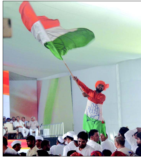
A Congress supporter waving party flag during the 'Jan Aakrosh' rally at Ramleela Maidan in New Delhi on Sunday.

and run away from the country is for everybody to see. "This is affecting the health of our banks," he said. He said the price of crude oil across the world was falling while in India the prices of petrol and diesel were constantly rising. He asked why this government was not working towards reducing the oil prices, which have put common man in great distress. "The time has come that we support Rahul Gandhi in making this country a better place," he said. Talking about unemployment, he said it was on the rise as the Modi Government has not created the much-promised two crore job opportunities, leaving youths and students, who had taken study loans, a worried lot in absence of jobs. (PTI)