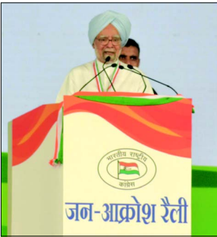
Former Prime Minister Manmohan Singh addressing the 'Jan Aakrosh' rally at Ramleela Maidan in New Delhi on Sunday.

NEW DELHI, APRIL 29/-/Former Prime Minister Manmohan Singh today sought support for the Congress and its president Rahul Gandhi, saying the democracy of the country is in danger with the Modi government consistently undermining its Constitutional institutions. Launching an all-out attack on the government, he said it has failed to fulfill all its promises it made before coming to the power and it's the time it should give an account of its works to the people of the country. The former Prime Minister claimed the anger among all sections of the society has shot up in the last four years due to the rising threat to the safety and security of the people and the vanishing employment opportunities, which has left the youths worried. Singh said the