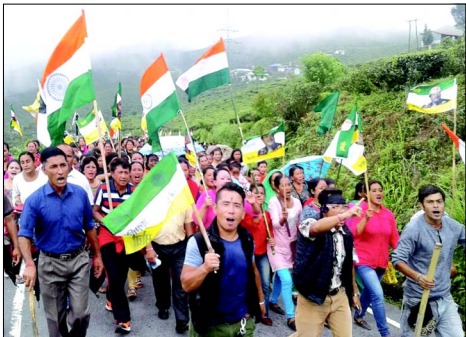
GJM supporters protest to press the demand for a separate state of 'Gorkhaland' in Mirik on Sunday.

091-2560401, and 0191-2542000. The home minister also had a telephonic conversation with the governor who has reached the accident site. Vohra too apprised him of the situation, officials said. "My heart goes out to the families of Amarnath Yatis who lost their loved ones in the bus accident. My prayers are with the injured," the home minister tweeted. The victims of the accident belonged to different states, officials said. (PTI)