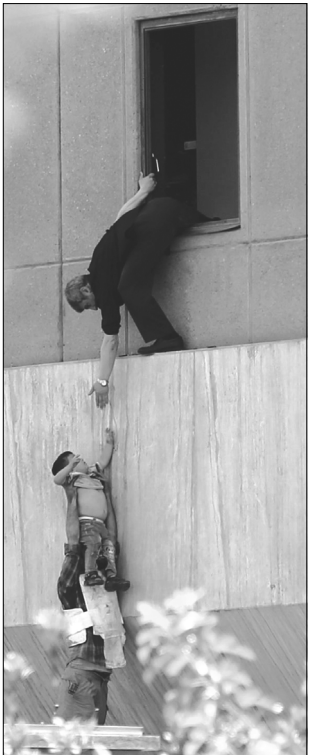
A boy is evacuated during the attack on the Iranian Parliament in central Tehran

KATHMANDU: Veteran Nepalese politician Sher Bahadur Deuba was today sworn in as the new prime minister of Nepal by President Bidya Devi Bhandari. The 70-year-old leader, who became Nepal's prime minister for the fourth time, succeeded Maoist leader Pushpa Kamal Dahal Prachanda who had resigned after nine months to honour a power-sharing deal and proposed Deuba's name. Deuba, the president of Nepal's oldest party—the Nepali Congress, was elected the 40th Prime Minister on Tuesday, following a vote in the Parliament.