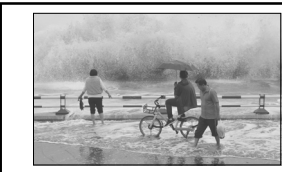
People look at waves crashing on concrete banks, on a flooded road in Qingdao, Shandong province, China