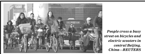
People cross a busy street on bicycles and electric scooters in central Beijing, China