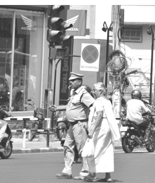
A police officer helping an elderly woman to cross the busy road in front of Secretariat in Thiruvananthapuram on Friday.