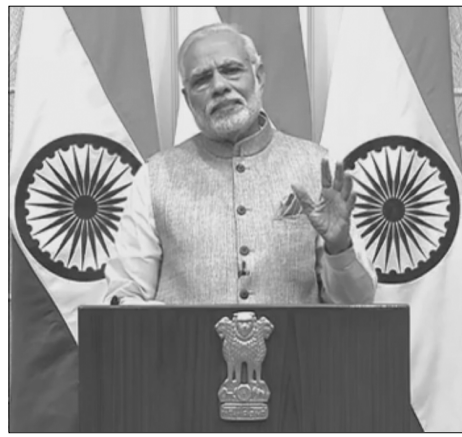
Prime Minister Narendra Modi addressing the nation

KOLKATA, DEC 31 /-- With DJ nights, cultural programmes and exotic cuisine, New Year's Eve revellers thronged hotels, pubs and hangout joints since evening to be a part of the midnight celebrations and welcome 2017 in style. All major clubs and hotels in the city were geared up with special parties offering a heady cocktail of dance, music, DJs, food and wine to bid farewell to the old year and ring in 2017. Park Street, the city's dining district, wore a festive look with balloons, twinklers and scintillating lights adorning the street for crowds. Most five star hotels of Kolkata are having poolside parties and buffet dinners with champagne and premium scotch. The police made elaborate security arrangements and posted extra forces for a tighter vigil. The state police also geared up security mechanism in the districts to prevent any untoward incident. Five star hotels, fine dining restaurants and cafes in the city, known to be food lover's paradise, are planning