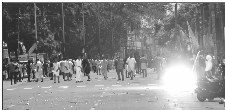
Police fire tear gas shells to disperse Youth Congress workers, who were staging a march demanding the arrest of real accused and CBI inquiry in murder of youth congress activist in Kannur in Thiruvananthapuram on Monday.