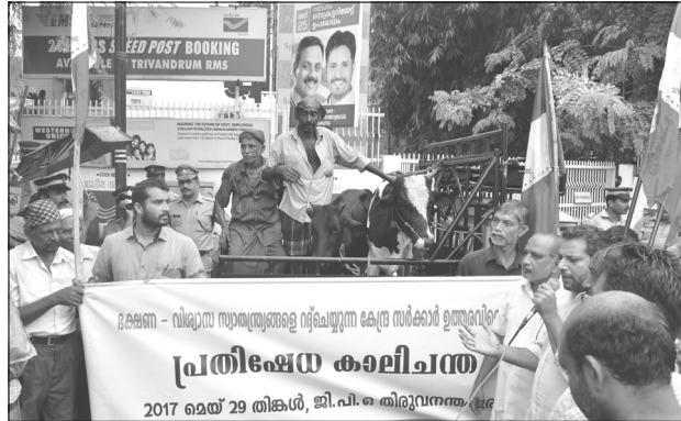
Welfare Party activists protesting against the new cattle slaughter rules by conducting a symbolic cattle market in front of General Post Office in Thiruvananthapuram on Monday.

The note-ban came as a blow to farmers, who are finding it hard to get agricultural loans ahead of the kharif season, the Marathi daily said. It has been over six months since demonetisation was announced. The decision badly affected the district co-operative banks, which are a key source of farm loans. The government is happy over the bull run in the stock market, but appears unperturbed about distressed farmers and "destruction" of district co-operative banks, it said. The Sena mouthpiece also hit out at the RBI over the scrapping of the high value notes. "Who gave the RBI the right to throw into dustbin the hard earned money of farmers?" it asked. (PTI)