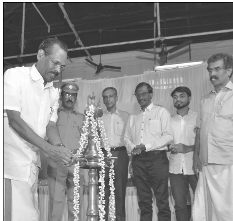
Kerala Excise and Labour Minister TP Ramakrishnan addressing the valedictory function of Road Safety Week at Town Hall in Kozhikode on Monday.