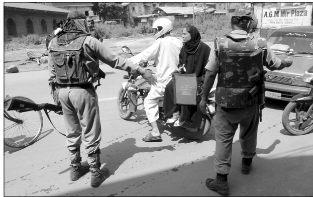
Security personnel diverting traffic from the areas where curfew like restriction were imposed at at Khaufia Bazaar in down town Srinagar on Saturday.