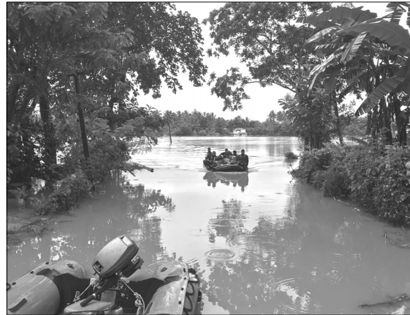
Southern Naval Command launched operation 'MADAD' for the rescue of marooned people and undertaking disaster relief operation in Kochi on Friday.

Spoke to Kerala CM Shri Pinarayi Vijayan and discussed the prevailing flood situation in the state. I have assured all possible assistance from the Centre to the state government. The relief and rescue ops are going on. MHA is closely monitoring the flood situation," Singh tweeted. (PTI)