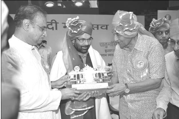
Union Minister of State for Minority Affairs (I/C) & Parliamentary Affairs, Mukhtar Abbas Naqvi at the Diksha Vashitop Ardhshatabdi Mahotsav of Jain Guru Shrimad Vijay Nityanand Ji at Talkatora Stadium in New Delhi.

According to Shah, along with development, BJP led by Parrikar has also given a government which has eradicated corruption. "Parrikar has given a government with transparency," he said. (PTI)