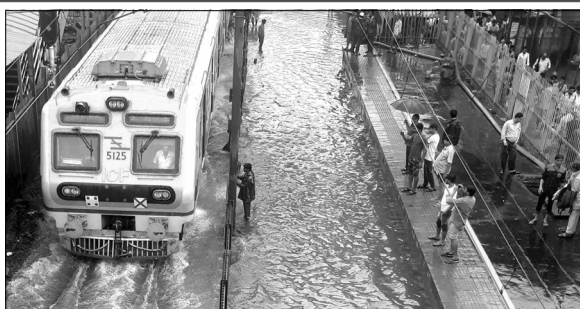
A local train passing through the flooded tracks after heavy rain in Mumbai on Monday.

MUMBAI, JULY 10 /- Suburban train services of the Western Railway were suspended today after heavy rains lashed the metropolis through the night, an official said. The India Meteorological Department (IMD) has predicted heavy to very heavy rain till Thursday. "Since last night, over 200 mm rainfall has been recorded. This has led to water logging on railway tracks and keeping in view passengers' safety, train services have been stopped till the water level on the tracks recede," the railway official said. Train services between Churchgate and Borivli were, however, normal. He said that pumps are being used to drain out water from tracks.