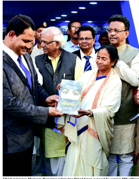
Chief minister Mamata Banerjee releasing 'Final Gazi', a novel by senior IPS officer Humayun Kabir in presence of the author (L) and other ministers at Kolkata International Book Fair

In the recently ended Biswa Bangla Global Business Summit, investment of Rs 2,19,925 crore had been pledged. As many as 110 MoUs had been signed with prospects of employment generation of more than 20 lakhs jobs," he added.