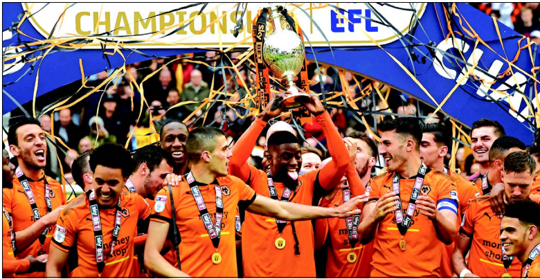
Championship - Wolverhampton Wanderers v Sheffield Wednesday - Molineux Stadium, Wolverhampton, Britain Wolverhampton Wanderers players celebrate winning the Championship