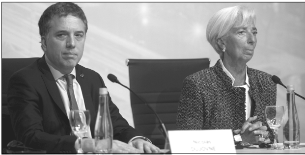
International Monetary Fund (IMF) Managing Director Christine Lagarde and Argentina's Treasury Minister Nicolas Dujone attend a news conference in Buenos Aires, Argentina

LUCKNOW, JULY 21 /- Power Grid Corporation of India Friday signed an MoU with Uttar Pradesh Power Corporation (UPPC) for energy efficiency and agricultural demand side management programme. Further discussions will be held between Power Grid Corp and UPPCL to decide terms and conditions of the probable agreement for Power grid acting as an investor as well as a Project Management Consultant (PMC) for replacement of agriculture pump sets in East and South DISCOMs of UP. (PTI)