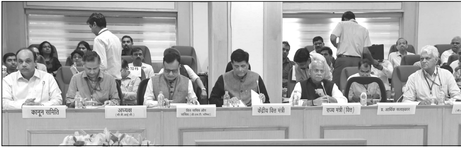
Union Minister for Railways, Coal, Finance and Corporate Affairs Piush Goyal chairing the 26th GST Council meeting, in New Delhi on Saturday.