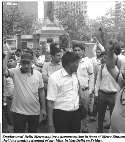
Employees of Delhi Metro staging a demonstration in front of Metro Bhawan to press their long pending demand of pay hike, in New Delhi on Friday.

MUMBAI, JUNE 29 /--/ Gold prices weakened further by Rs 160 to Rs 39,470 per 10 grams at the bullion market on Friday due to slackened demand from jewellers at prevailing levels, even as the metal strengthened overseas. Silver prices also declined by Rs 270 to Rs 99,220 per 10 grams compared to Rs 30,630 earlier. Standard gold (99.99 per cent purity) ended at Rs 39,470 to Rs 39,220 as compared to Rs 39,480 previously. Globally, gold prices recovered from six-month lows as speculators took profits amid a weaker dollar, but some analysts warned that losses were likely.