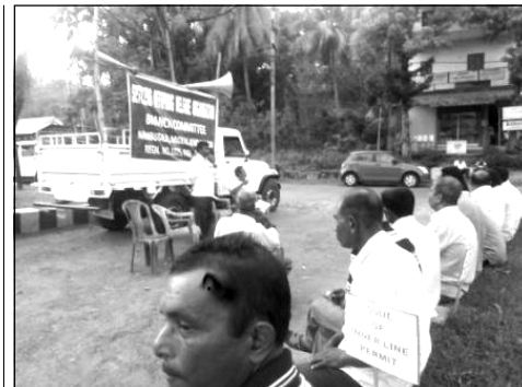
Picture shows Special Gram Sabha meeting being held at Nimbatala Gram Panchayat in Middle Andaman last week on the occasion of National Panchayat Diwas. The Pradhan of Nimbatala Panchayat, Panchayat Secretary and officials from line departments sensitized a gathering of more than 150 villagers about the benefits of various centrally sponsored schemes.