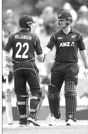
Neil Broom and Kane Williamson's 179-run second-wicket stand defeated Bangladesh

NELSON, DEC 31 /- Fill-in batsman Neil Broom and skipper Kane Williamson produced a match-winning 179-run stand for New Zealand to crush Bangladesh in their final one-day match in Nelson on Saturday. Williamson was left unbeaten on 95 while Broom fell just before the hour for 97 as the hosts overhauled Bangladesh's 226 for the loss of only two wickets to sweep the series 3-0. For the 33-year-old Broom, battling to prove his worth to the national squad, it was his second consecutive match-winning performance after his unbeaten 106 in New Zealand won the second match by 67 runs. Broom, who scored 22 in the first match, which New Zealand won by 77 runs, was recalled for the Bangladesh series after nearly seven years in the wilderness. He is the number four batting slot while Ross Taylor recovers from eye surgery. He has since been the home side's stand-out performer, notably with his prolific scoring, but also his magic touch on the field with some athletic catches. Williamson was full of praise for his batting partner and his contribution to the win.