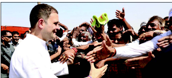
Rahul Gandhi interacting with party members at a corner meeting in Maniya in Dholpur, Rajasthan

Blames Centre's economic policies and 'poorly-implemented' GST for rise in unemployment