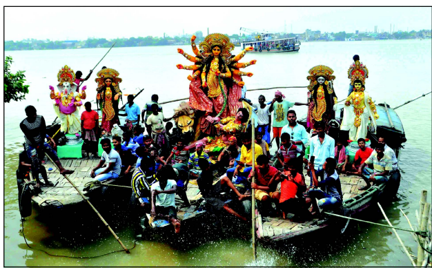
IDOL TIME IN KOLKATA: Ferrying the Goddess across river Hooghly