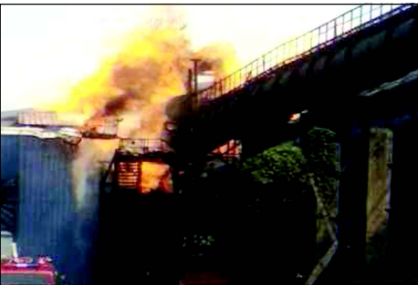
The raging fire at Bhilai Steel Plant

RAIPUR, OCT 9 /-/- Nine people were killed and 14 others sustained injury today in a blast at the Bhilai Steel Plant of state-owned SAIL in Chhattisgarh's Durg district, police said.