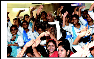
Children learn Kathak under the guidance of Kathak Maestro Padma Vibhushan Pandit Birju Maharaj during the first day of four days long Kathak Workshop in Patna on Tuesday