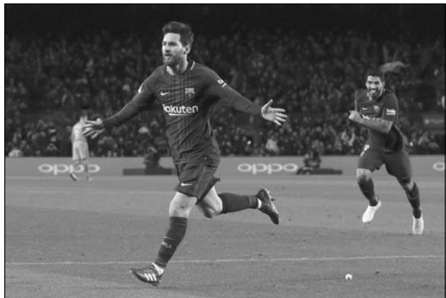
Barcelona's Lionel Messi celebrates scoring their second goal with Luis Suarez

praise for the Indian skipper. "He is a top-class batsman. He is way above the rest of Indian batsmen in this team. When I think of the past Indian batsmen, Sachin Tendulkar was the best batsman in his team. But he was a bit far ahead of people like Rahul Dravid or VVS Laxman. He was better than them but not miles ahead," Holding said. "Virat is miles ahead of everybody on this Indian team but I don't think it influences his captaincy. And as soon as Virat gets some runs in England, I am happy to put the label great beside his name. At the moment I am just waiting," (PTI)