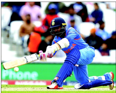
Dinesh Karthik in action during warm-up match against Bangladesh ahead ICC Champions Trophy at The Oval, in London.

LONDON, MAY 30 /-/- Dinesh Karthik made a strong case for a middle-order slot with a stylish 94 off 77 balls to propel India to a formidable 324 for seven against Bangladesh in their second ICC Champions Trophy warm-up game here today.