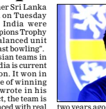
Kumar Sangakkara on Tuesday said defending champions India were capable of retaining the Champions Trophy title as they were a better balanced unit with "real firepower in their fast bowling".

LONDON, MAY 30 /-/- Former Sri Lanka skipper Kumar Sangakkara on Tuesday said defending champions India were capable of retaining the Champions Trophy title as they were a better balanced unit with "real firepower in their fast bowling".