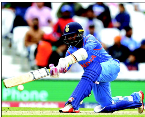
Dinesh Karthik in action during warm-up match against Bangladesh ahead ICC Champions Trophy at The Oval, in London.

LONDON, MAY 30 /-/- Dinesh Karthik made a strong case for a middle-order slot with a stylish 94 off 77 balls to propel India to a formidable 324 for seven against Bangladesh in their second ICC Champions Trophy warm-up game here today.