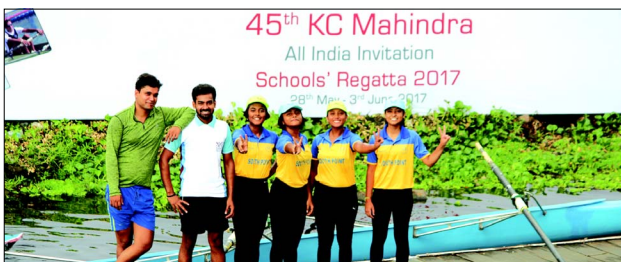
South Point Junior Girls team along with their Cox and Coach