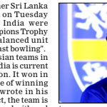
Former Sri Lanka skipper Kumar Sangakkara on Tuesday said defending champions India were capable of retaining the Champions Trophy title as they were a better balanced unit with "real firepower in their fast bowling".

LONDON, MAY 30 /-/- Former Sri Lanka skipper Kumar Sangakkara on Tuesday said defending champions India were capable of retaining the Champions Trophy title as they were a better balanced unit with "real firepower in their fast bowling".