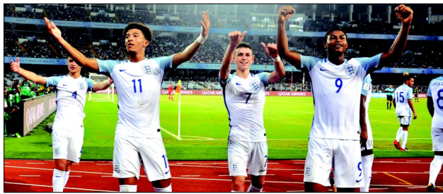
U17 World Cup match between England and Mexico at Salt Lake Stadium in Kolkata on Wednesday

ENGLAND : 3 (R. BREWSTER (39) P. FODEN (48) J. SANCHO (55 PEN)) MEXICO : 2 (D. LAINEZ (65) D. LAINEZ (72))