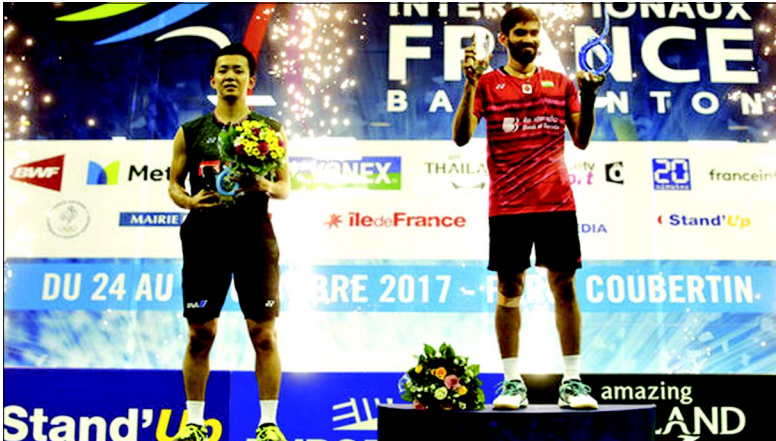
Kidambi Srikanth is the first Indian badminton player to win four Superseries titles in a year

HYDERABAD, OCT 31 /- In the best form of his life, after winning four Super Series titles in five months, star India shuttler Kidambi Srikanth said that the days of domination of Lin Dan or Lee Chong Wei are over and the tournaments are more wide open than ever. Srikanth, who became the first Indian and only fourth men's singles player in the world to win four Super Series titles in a calendar year, said not a few but many players, including him, are capable of winning top tournaments these days. "For a long time I think (Malaysian) Lee Chong Wei and (China's) Lin Dan have dominated badminton. And now it has become more open. Me, Viktor (Axelsen) and even other Indian players are winning tournaments. It has become more wide open and it's always good for the sport when you have so many champions," he told