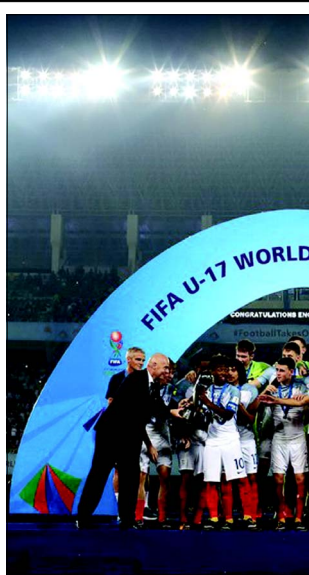
FIFA President Gianni Infantino delivers the champion trophy to the captain Angel Gomes of England after the FIFA U-17 World Cup India 2017 Final match between England and Spain at Vivekananda Yuba Bharati Krirangan - File photo

LONDON, OCT 31 /- At a time when England have been pilloried by their own fans after a laboured World Cup qualifying campaign, the country's promising prodigies offer hope of a brighter future. England's starlets enjoyed a 5-2 win over Spain in the under-17 World Cup final in Kolkata on Saturday, capturing a remarkable scenario in which the country's bright young things dominated on the global stage. In the past five months, England's under-17 and under-20 teams have been crowned world champions, while the under-19s won the European Championship. A mixed-age England squad also successfully defended the prestigious Toulon title in June and the country's youth teams have lost only twice, both times on penalties, across 34 tournament matches. That successful streak is a stark contrast to the drab performance of Gareth Southgate's senior side en route to next year's World Cup in Russia. Bored fans even threw paper aeroplanes onto the pitch throughout a tedious qualification-sealing win against Slovenia that offered little hope England can improve on their wretched major tournament record. Consigned to a humiliating Euro 2016 exit by managers Les Ferdinand and bundled out of the 2014 World Cup at the