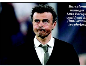
Barcelona manager Luis Enrique could end his final season trophyless

BARCELONA, APRIL 20 /—/ Barcelona boss Luis Enrique insists his final season in charge can still end in glory despite bowing out of the Champions League at the quarter-final stage to Juventus. Juventus held their 3-0 first leg lead to progress to the last four by blunting Barca's star-studded attack in a 0-0 draw yesterday. Neymar left the field in tears, but around the Camp Nou there was appreciation for Barca's valiant effort by the near 100,000 crowd. "It's a sad night, but we tried until the last minute and that was recognised by the fans at the end," said Enrique, who will step down at the end of the campaign. "This is (a) team that never gives up, that fights for every title, doesn't relax and always accepts the challenge. "It is a joy to belong to a club like this." Barca travel to face eternal rivals Real Madrid in El Clasico on Sunday realistically needing to win to maintain their hopes of a third straight La Liga title. Madrid led by three points at the top of the table, but also have a game in hand. Barca have a team built to compete, to win trophies and to face every challenge. "It is clear we are very hurt to be eliminated from a competition that excites us so much, but now comes a key game against the leaders and a direct rival. "We have to get ready to compete and I am sure we will do that." Barca will be without Neymar at the Bernabeu