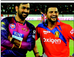
MS Dhoni and Suresh Raina.

KOLKATA, APR 20 /—/ He was one of Mahendra Singh Dhoni's trusted lieutenants during the best days of Chennai Super Kings and not only a player, but also feels disappointed in the manner he was removed from Rising Pune Supergiant's captaincy. "I was disappointed. He has done so well for the country as well as for the IPL teams. He should be respected every time. It's about not me saying, it's the world saying," Raina told PTI in an interview. Dhoni has so far scored only 61 runs in five games with a strike-rate of 87 and that has invited criticism from all quarters. "Having shared the dressing room with him (for India and CSK), you know what goes through