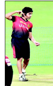
KKR captain Gautam Gambhir, Sunil Narine and Suryakumar Yadav inspect the pitch in a practice session at Eden Garden in Kolkata

With the team getting well and enjoying a winning momentum, there may not be any need to tinker KKR's line-up but in hindsight it is perplexing to see star Bangladeshi all-rounder Shakib Al-Hasan warming the bench. Andre Russell's replacement Colin de Grandhomme has failed to make much impact from three games and Shakib may give a better overseas option to skipper Gautam Gambhir. Their smooth campaign so far, notwithstanding, KKR would be worried about the