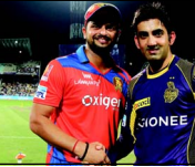
Kolkata Knight Riders players in action during a match.

KOLKATA, APR 20 /—/ High on confidence following a hat-trick of victories, two-time champions Kolkata Knight Riders would look to continue their winning streak when they face struggling Gujarat Lions in a battle between the top and bottom-placed teams of the