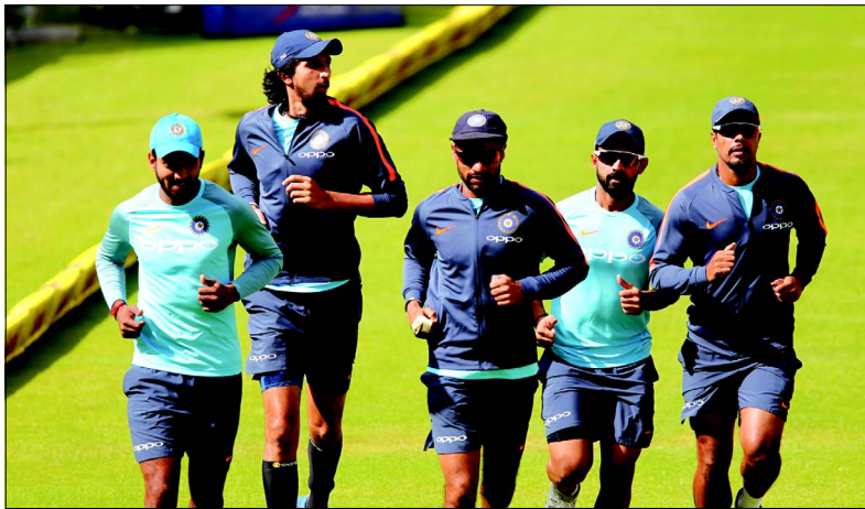
India cricket players warm up ahead of their match

CENTURION, JAN 11 /-/- India couldn't have hoped for a worst start to a long South African sojourn but pacer Jasprit Bumrah today asserted that if one debacle dents the team's confidence then it "does not deserve" to play Test cricket. South Africa outplayed India by 72 runs inside four days in the opening Test in Cape Town to claim a 1-0 lead in the three-match series. The second Test is scheduled to start here on Saturday. "Confidence is not dented after one match. If it happens, then you don't deserve to play. Learn from the mistake you made and go forward. There is not a single cricketer who has not made a mistake," asserted Bumrah, who took four wickets in the match. "It was a first good Test and a good learning experience for me because I have never played over here in South Africa. So I had a lot of things to learn from it. Now it is time to move forward and focus on the second Test," Bumrah said on Thursday. Bumrah said he would rather pick the positives, including