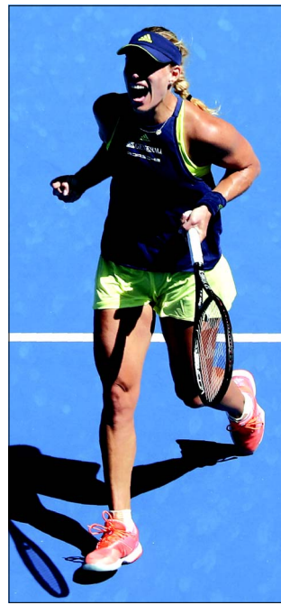
Angelique Kerber of Germany celebrates winning against Hsieh Su-Wei of Taiwan.

MELBOURNE, JAN 22 /- Six-times champion Novak Djokovic bowed out of the Australian Open in the fourth round as relentless South Korean Chung Hyeon ground him down to claim a stunning 7-6(4), 7-5, 7-6(3) victory on Monday. The 21-year-old Chung, ranked 58th in the world, proved an immovable object, absorbing everything the former world number one could throw at him and returning it with interest. Djokovic, grimacing occasionally and flexing his elbow, dropped the opening four games and although he clawed back the deficit, Chung took the opening set on the tiebreak. Chung moved 4-1 ahead in the second set but again Djokovic recovered, only to falter when serving at 5-6, netting a forehand on set point after Chung had shown incredible defensive skills to stay alive in the rally. Again Djokovic battled back from a break down in the third set to force a tiebreak but Chung refused to let the 30-year-old Serb off the hook. Chung hooked a mind-boggling forehand winner past Djokovic to take a 5-3 lead in the tiebreak and when Djokovic netted a return it brought up three match points.