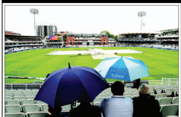
General view of spectators sheltering under umbrellas during a rain delay The toss has been delayed as rain dominated the opening day of the second Test between India and England at the Lord's Cricket Ground in London on Thursday, thus far. The rain also forced the lunch to be called-up early. Before that, the ground staff were seen walking over the covers, and inspecting the conditions, with the weather forecast suggesting the skies will clear up in due course. However, more updates are awaited on the same. Meanwhile, after a poor show in the opening Test match against England, India will face the hosts in the second match of the five-match series. In both the innings of the first Test which the tourists lost by 31 runs, all the batsmen, apart from skipper Virat Kohli, failed. No other batters supported Kohli, who at the other hand fought valiantly. Kohli scored 149 in the first innings while the other batsmen could only score 107 runs combined.