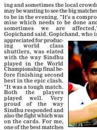
Saina Nehwal and P V Sindhu in action during their match.

bronze medal in the world event and men's players K Srikanth and B Sai Praneeth for their competitive performances. Asked about sports scene in the country as it celebrated National Sports Day today, Gopichand said sports in India is at a stage where it has never been in the past. We have the highest offices in the country talking about sport in a big way. We never had somebody at the Prime Minister's level address this issue of sports successfully over so many months," he said. A lot has been achieved in badminton and a lot more needs to be achieved, he said. "Hopefully, things will improve. I would say that a lot has been spoken. A lot has been done. But a lot more needs to be done. Because, the whole world is competing and we need to ensure that we put our best foot forward," he said. (PTI)