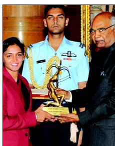
President Ram Nath Kovind presenting the Arjuna Award, 2017 to Harmanpreet Kaur for Cricket, in a glittering ceremony at Rashtrapati Bhawan, in New Delhi