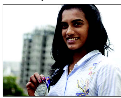
PV Sindhu is the only Indian badminton player to win both Olympics silver medal and World Badminton Championship silver medal.