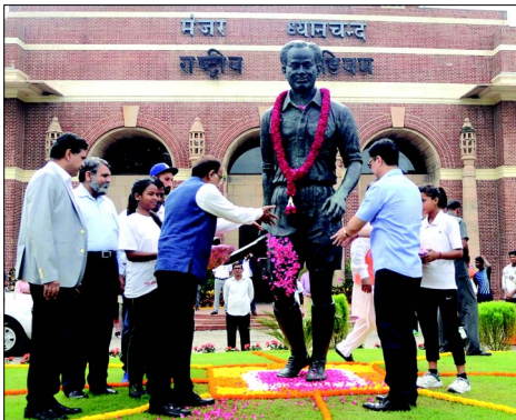
Minister of State for Youth Affairs and Sports (I/C), Water Resources, River Development and Ganga Rejuvenation, Vijay Goel and the Minister of State for Home Affairs, Kiren Rijiju paying tributes to Hockey Legend Major Dhyyan Chand, on his 112th Birth Anniversary on the occasion to commemorate the 'National Sports Day', in New Delhi on Tuesday.

NEW DELHI, AUG 29 /-/- Prime Minister Narendra Modi today paid tributes to legendary hockey player Major Dhyyan Chand, and congratulated all sports persons and enthusiasts on the occasion of National Sports Day. In a series of tweets, Modi said, "On #NationalSportsDay, I congratulate all sports persons and sports enthusiasts who pursue sports with great vigour and passion. I pay tributes to the exemplary Major Dhyyan Chand, whose legendary sporting skills did wonders for Indian hockey," he tweeted. Modi said India is blessed with immense sporting talent, and to harness this potential, a portal was launched by the Sports Ministry. "The #NationalSportsTalentSearchPortal gives essential direction and support to youngsters to pursue their sporting aspirations and shine," he said. (PTI)