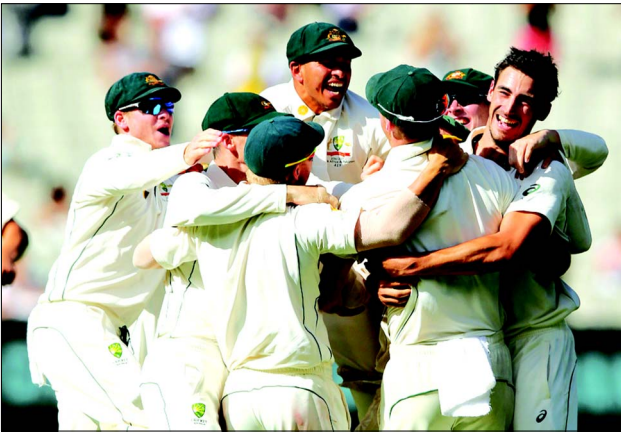
Australia celebrate their victory