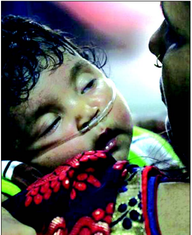
A child being administered oxygen at the BRD Medical College at Gorakhpur.