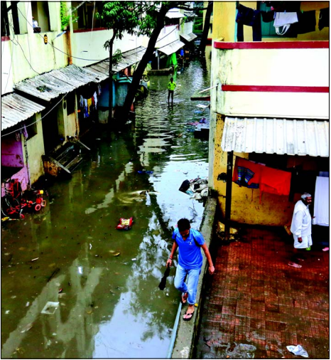
A man balances himself as he walks on a wall at a waterlogged neighbourhood in Mumbai