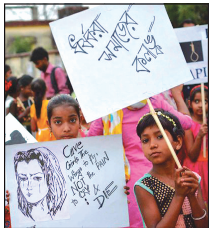
Children at a rally against atrocities on women

where she was touched and how much pain she experienced. She was made to repeat her statement again and again for months. I want to ask everyone if I was wrong to ask for justice for my daughter," he said. The Union Cabinet, two days ago, cleared the Criminal Law (Amendment) Ordinance 2018, which proposes stringent punishments, ranging from a minimum of 20 years to life term or death, for raping girls below the age of 12. President Ram Nath Kovind has approved the ordinance. The Ordinance was brought after a nationwide outrage over cases of sexual assault and killing of minors in Kathua in Jammu and Kashmir, in Gujarat's Surat, and the rape of a girl in Unnao in Uttar Pradesh. Child rights groups reiterated that the real deterrent in such cases is the implementation of the laws and the certainty of punishment, rather than the