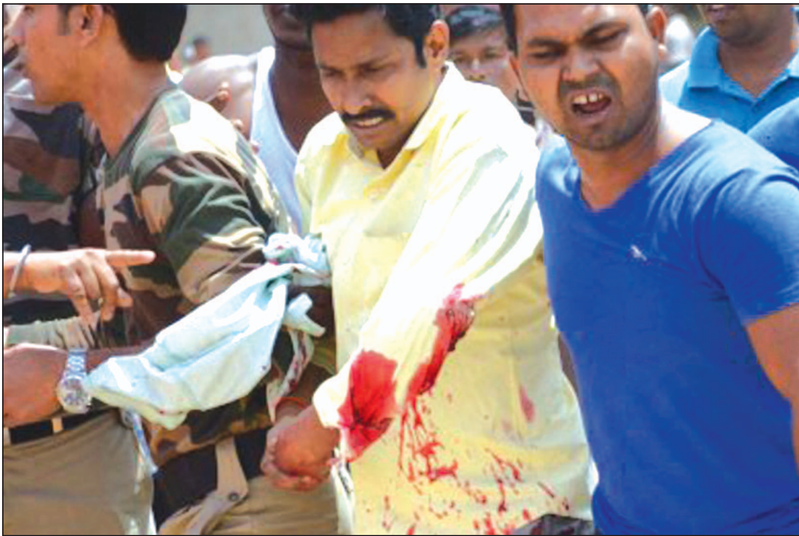
An injured person being taken to hospital, at Suri, Monday